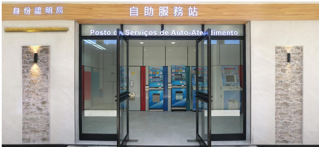
DSI Self-Service Station