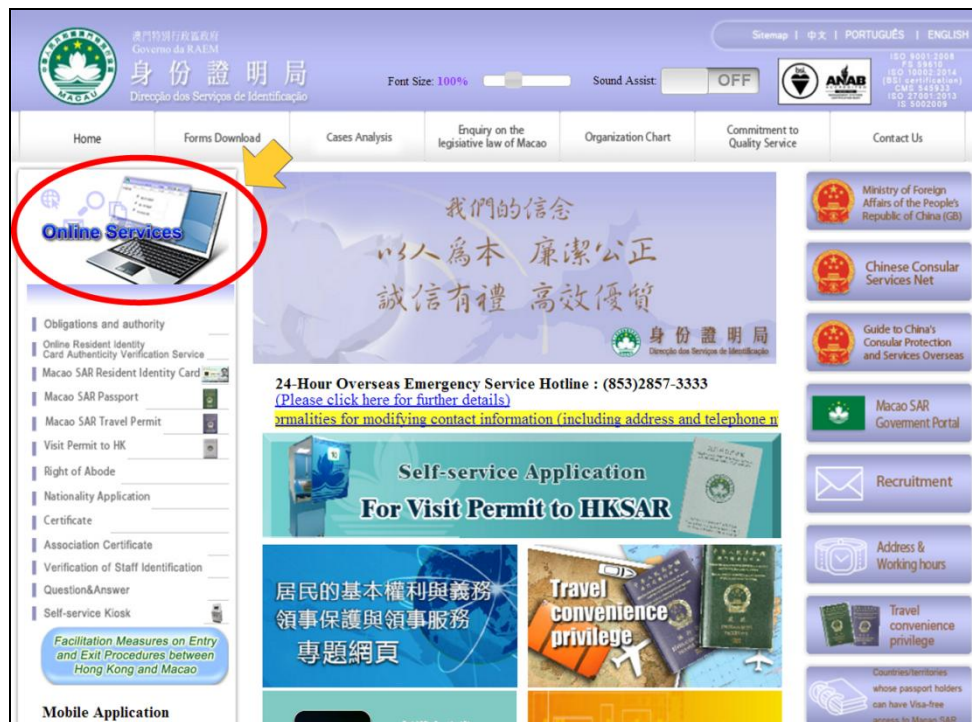
DSI's "Online Services" zone

Later, DSI will introduce online application service for the Certificate of Association, and will continue to provide Macao residents with more diversified electronic services to enhance service quality.