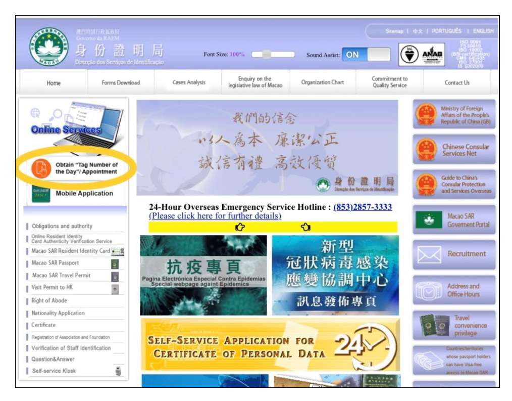
Citizens can obtain number tag of the day or make appointment on DSI website