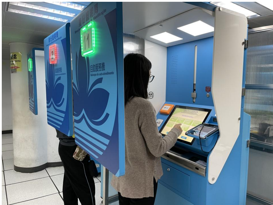
DSI's self-service kiosks

For details about DSI services, please refer to DSI's website ( www.dsi.gov.mo ). For enquiries, please call DSI at 2837-0777 or 2837-0888 or email to info@dsi.gov.mo .